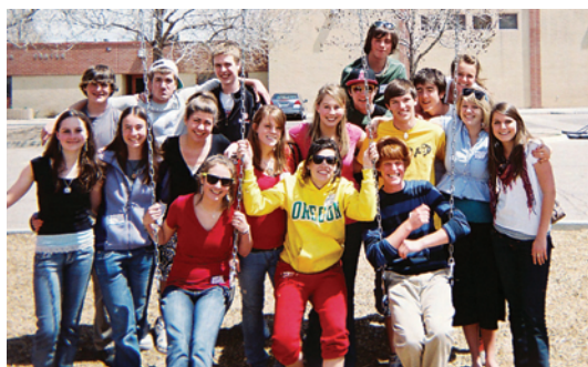
Become the High School Graduates of 2009

High School Graduates gathered for a celebratory brunch in April 2009. The list of college admissions and scholarships garnered by this group of former MPB students is impressive; from scholarships in academics, athletics, and music, to a Boettcher scholarship. Good Luck Class of 2009!!!