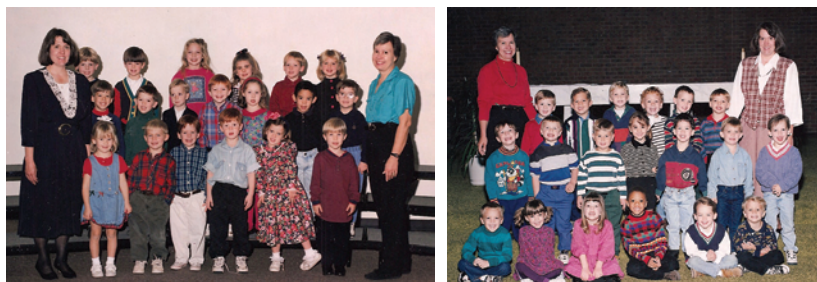
Former MPB Pre-kidg Classes of 1995